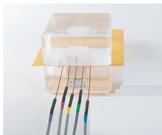
A Film placed between the two sub-phantoms using MOSFETs dosimeters for IMRT plan.