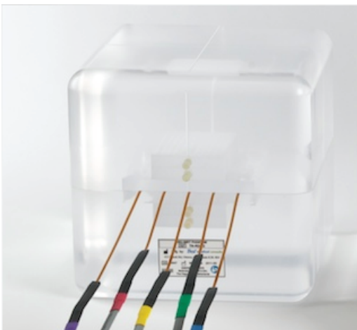
XWU-IMRT Phantom for 3D dosimetry using MOSFETs.

The XWU-IMRT Phantom (TN-RD-52) is ideal for obtaining quantitative dose measurements for film and MOSFET dosimetry. This 20cm x 20cm block phantom houses film and a minimum of nine MOSFET dosimeters on two orthogonal planes. One of the planes, containing five MOSFET detection points, is the dividing plane of the two sub-phantoms where a film is housed. Five absolute MOSFET dose points on the plane of the film provide dose verification. Easy to use cassettes come with pre-manufactured slots for the dosimeters and allow for greater versatility. (Additional cartridge for ion chamber comparison also available.)